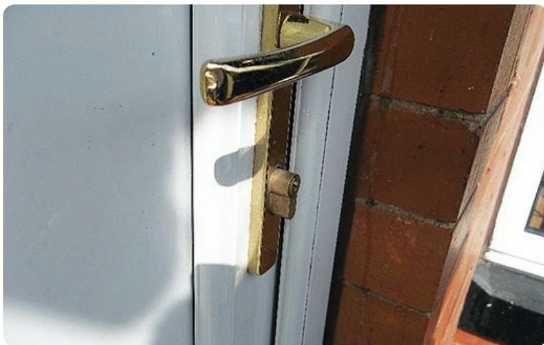
◀ Incorrectly measured lock protruding from the door handle

Contact your local Crime Reduction Officers for any further advice, simply call 101 or email: LeedsCPO@westyorkshire.pnn.police.uk